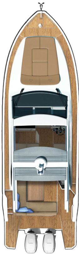
LOWER DECK with extended bathing platform