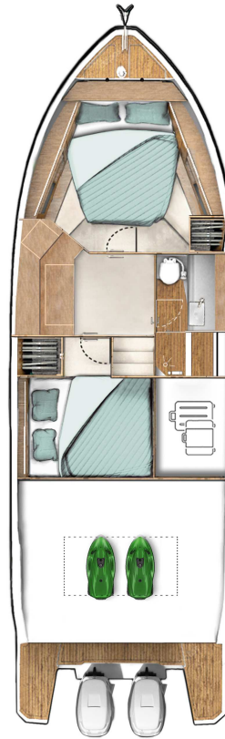
LOWER DECK standard