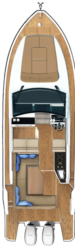
LOWER DECK with extended bathing platform