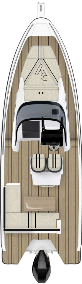
OPTION Table, wetbar, bench & bow upholstery