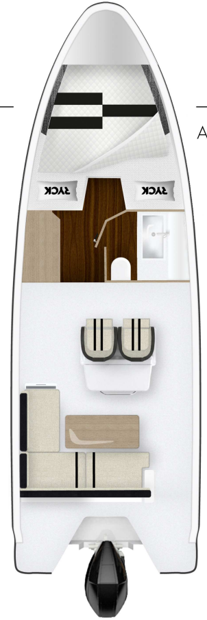
OPTION Cabin & Head