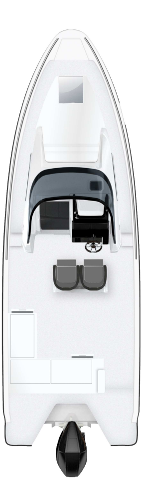
STANDARD Fiberglass deck