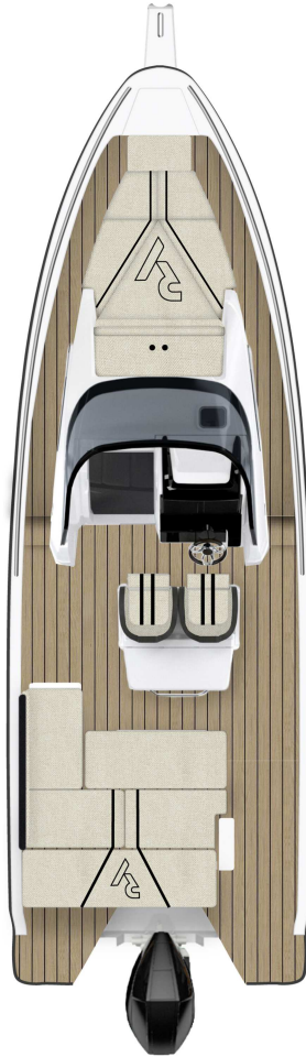
OPTION Back rest lower & raise, wetbar